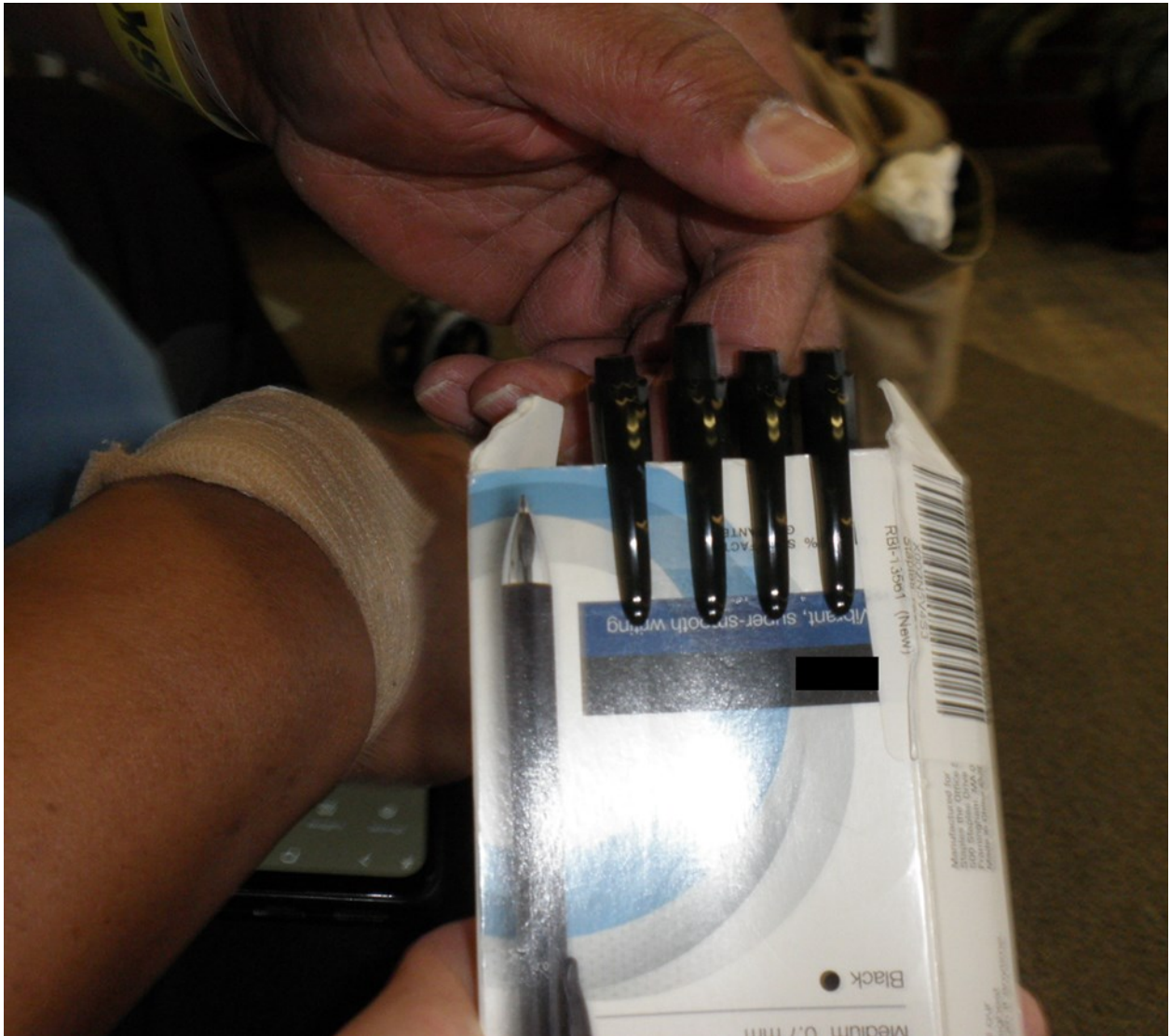
Photograph 1. Pen Gift Box Delivery System

been disinfected. This is your pen to keep. It is a gift for your participation in this survey.” (See Photograph (1): Pen Gift Box Delivery System) The presentation is both aesthetically appealing and slightly dramatic.